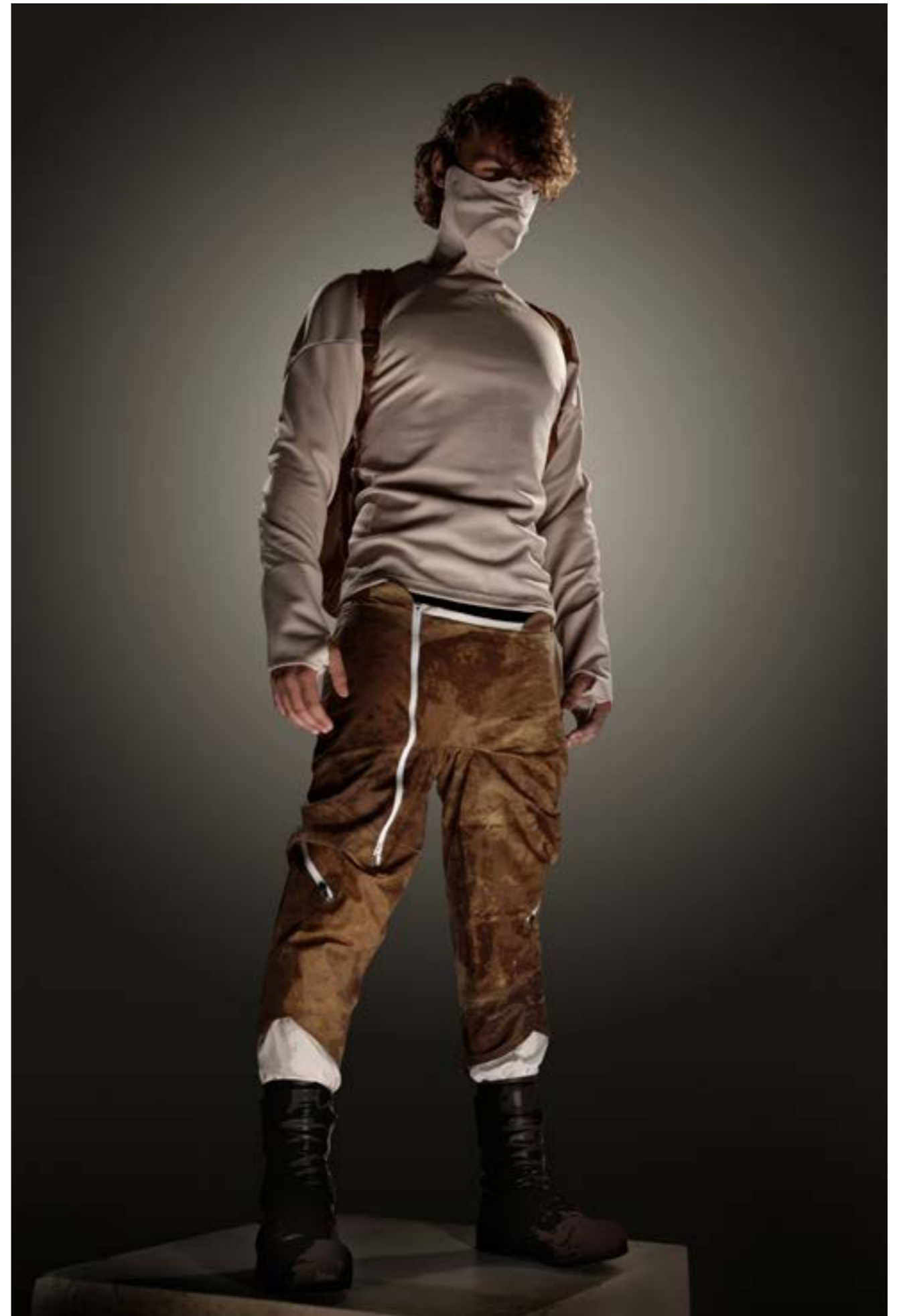
Designer: Daniel Kirk